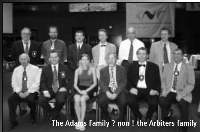
The Adams Family ? non ! the Arbiters family